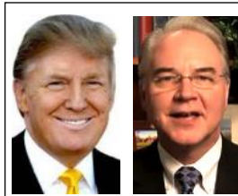
President-elect Donald Trump (l) has promised to defund PP and nominated pro-life Congressman, Dr. Tom Price, to head HHS

Grassley's announcement followed the release of a lengthy report by the Judiciary Committee's majority staff, analyzing more than 20,000 pages of documents obtained from the tissue procurement companies and Planned Parenthood. The report alleges since 2010 three companies — Advanced Bioscience Resources, Inc.; StemExpress, LLC; and Novogenix Laboratories, LLC — have paid Planned Parenthood for aborted fetal body parts, which they then sold to respective customers "at substantially higher prices than their documented costs."