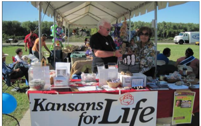
A September 2012 pro-life booth at a Kansas City area Hispanic Fiesta.

If you would like to volunteer at booths in the Kansas City, Topeka, or Wichita areas please contact the KFL office in that city. To volunteer for the Kansas State Fair in Hutchinson, contact the Wichita office.