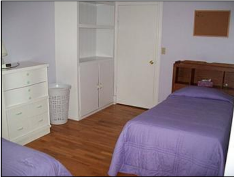
One of the resident bedrooms at the Mary Elizabeth Maternity Home in Hays.

All of these homes appreciate cash donations, as they are only partially supported by government funding. Donations of clothing, adult personal care supplies, infant care supplies, groceries, and other items are also appreciated. Please contact the maternity home you would like to support to ask what kinds of donations are needed.